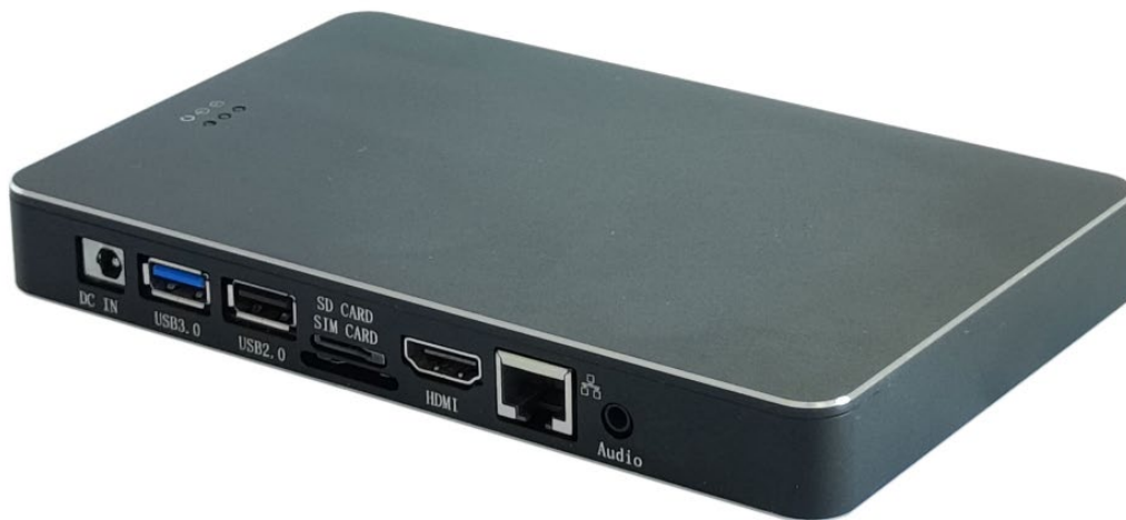
Pc bottom diagram