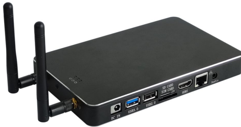
图 片 仅 供 参 考 ， 请 以 实 物 为 准 ！